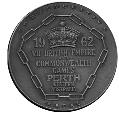
1962 Perth Medal